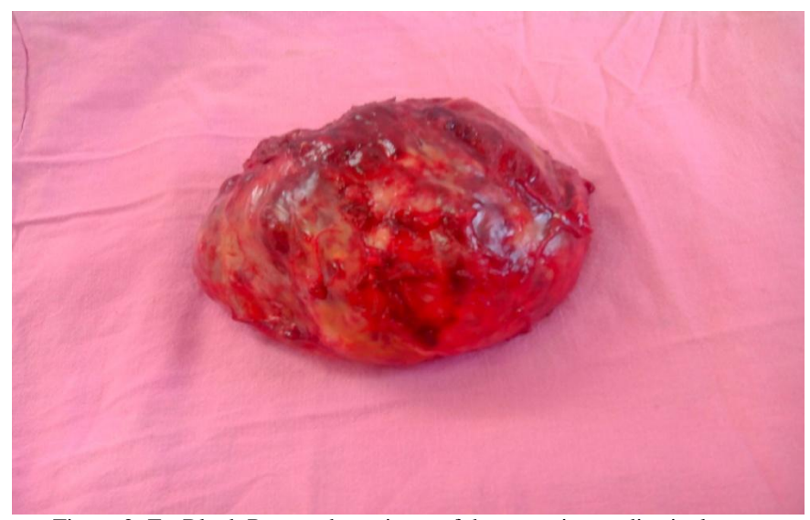
Figure 2: En-Block Resected specimen of the posterior mediastinal mass